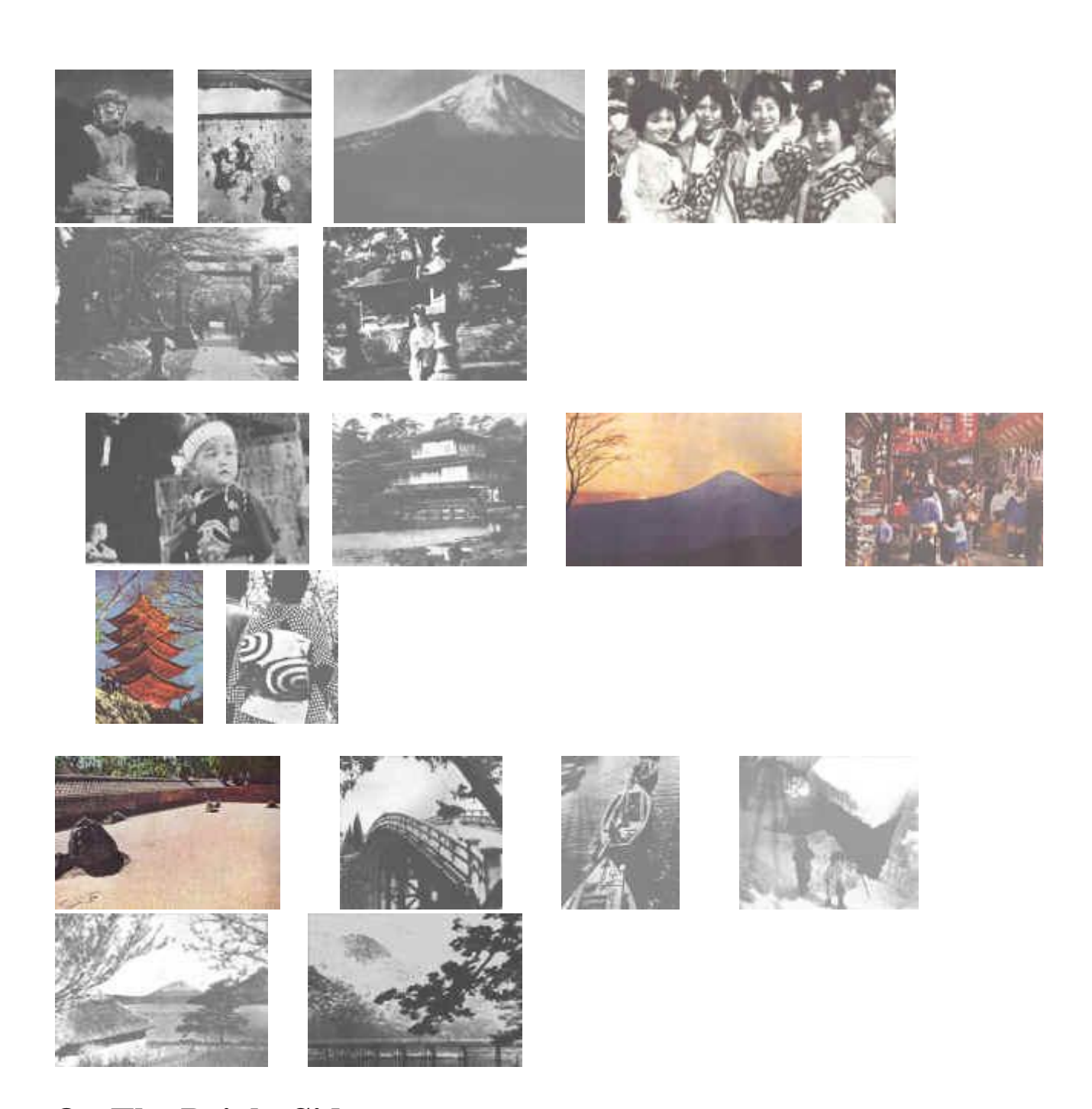
On The Bright Side......